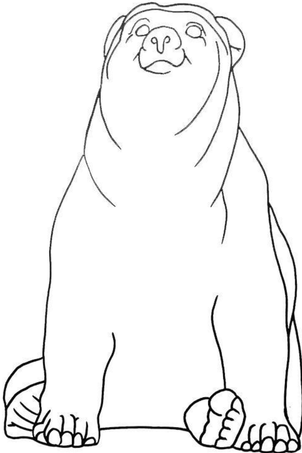
Sitting Bear 21” Tall